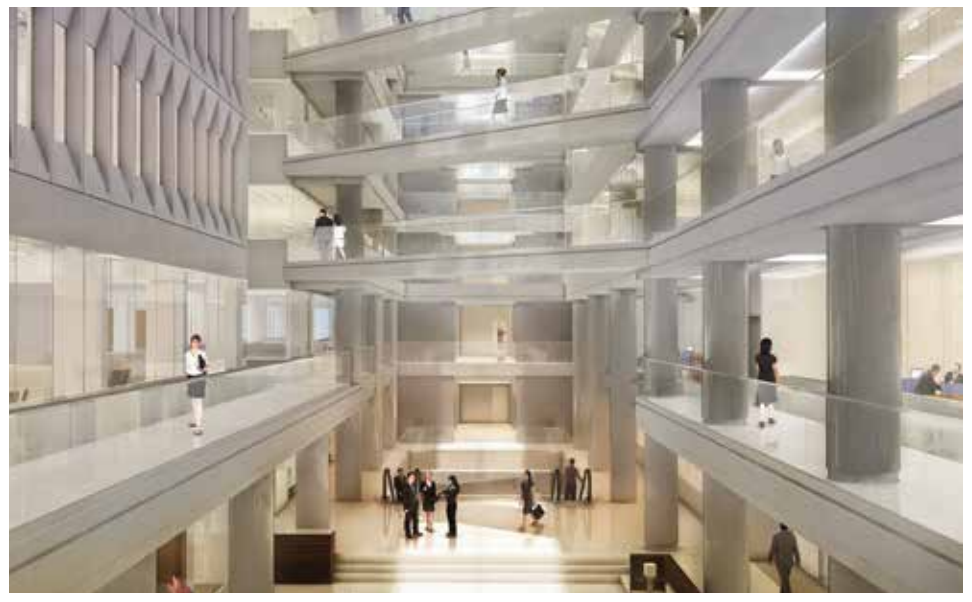
SILVERLINE CENTER, TYSONS, VA