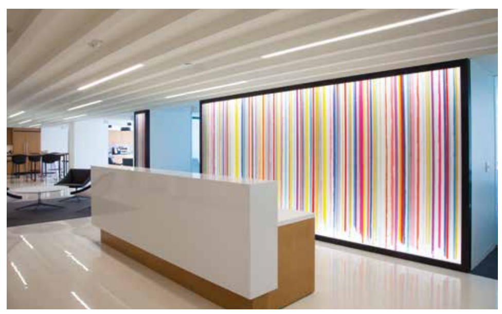
1775 EYE STREET, WASHINGTON, DC

We are engaged in creating value through an active asset management strategy and an opportunistic, value-add acquisition plan. Under our Portfolio Management Model, seasoned asset managers and portfolio managers oversee each individual asset with accountability for managing NOI growth and maximizing the value of every asset in the portfolio. In 2014, we created a Real Estate Services Group to improve tenant services and better coordinate the tenant experience within our portfolio from signing through move-in, and throughout the lease term. By outsourcing leasing and other functions to highlyexperienced third parties, we have streamlined our operations so the Washington REIT team can focus on reshaping and managing our portfolio and creating value for the future.