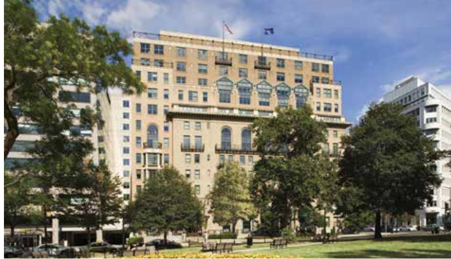
THE ARMY NAVY CLUB BUILDING, WASHINGTON, DC