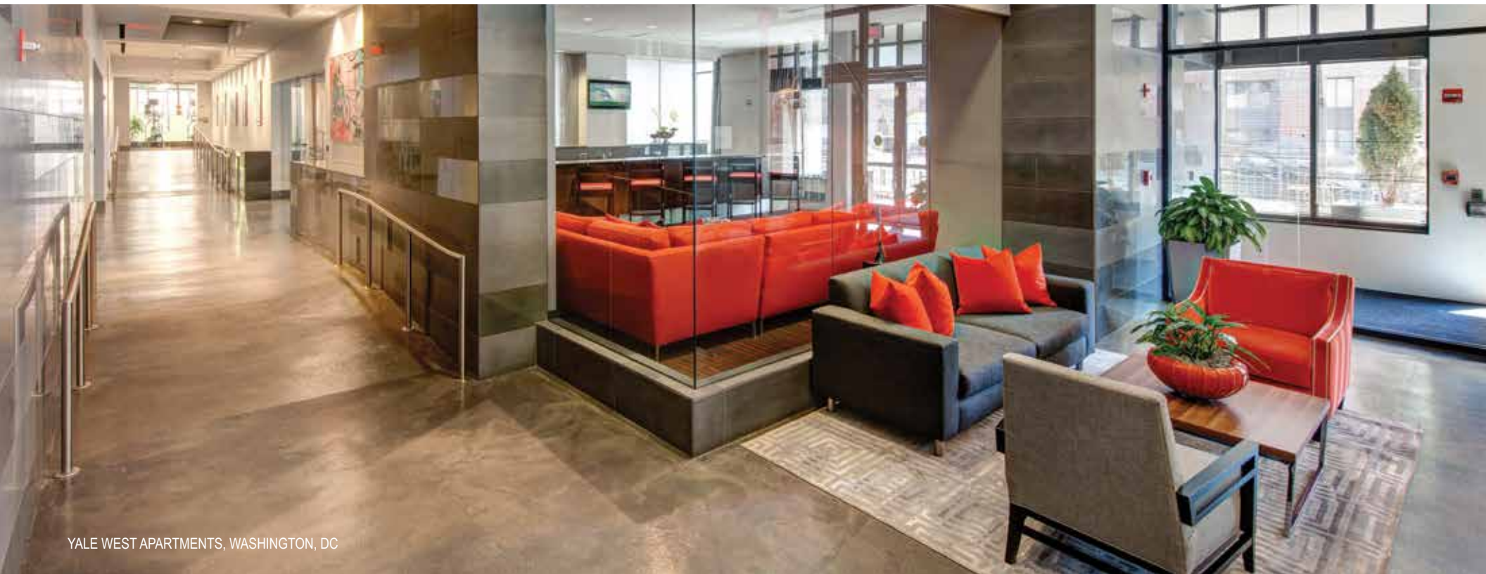
YALE WEST APARTMENTS, WASHINGTON, DC