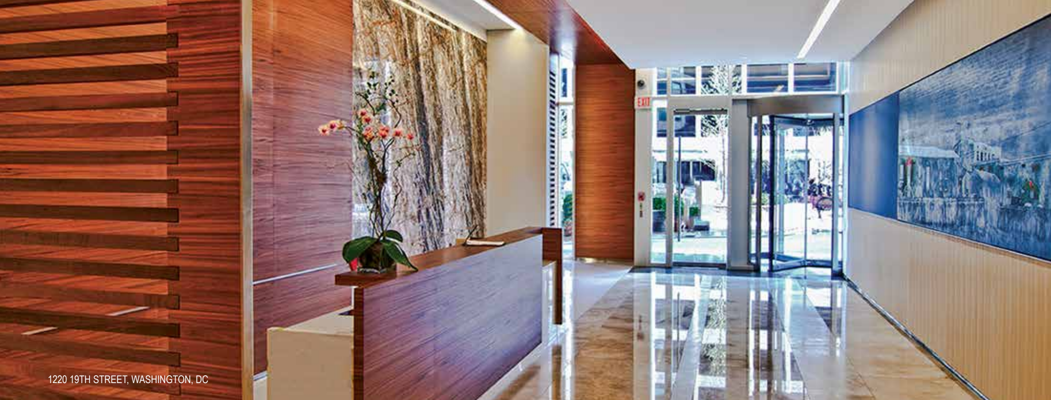
1220 19TH STREET, WASHINGTON, DC