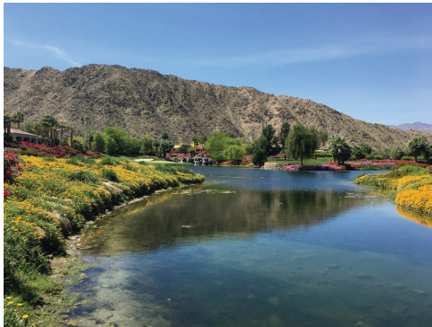
Moleaer's nanobubble generator saturates the feeder tank with nanobubbles before being dispersed into the irrigation system.