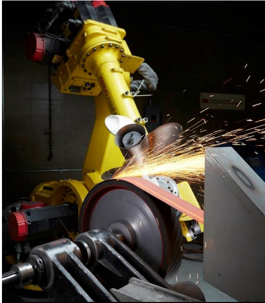
Safety & Industrial