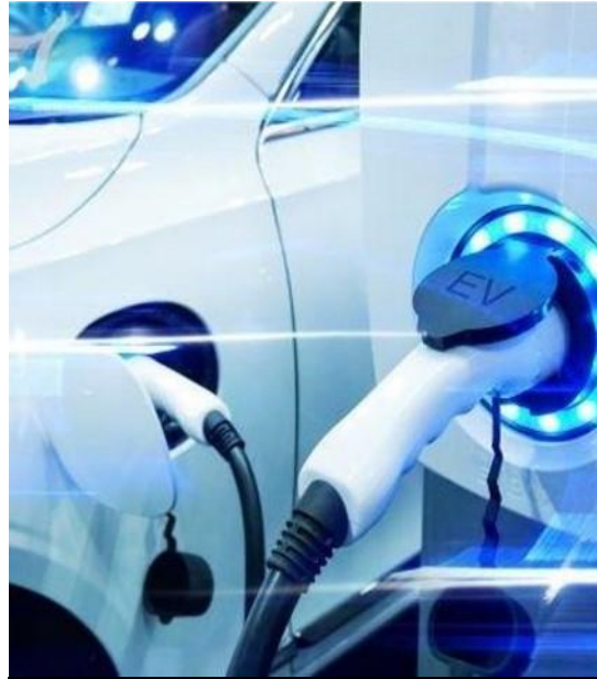
Transportation & Electronics