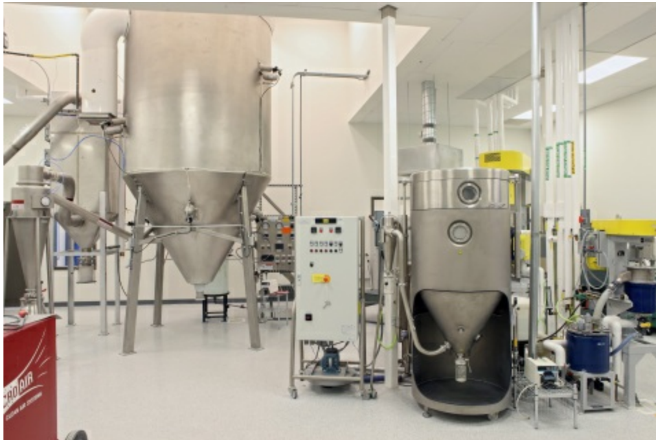
Silicon Nitride powder preparation at SINTX Technologies.

This press release features multimedia. View the full release here: https://www.businesswire.com/news/home/20201006005116/en/