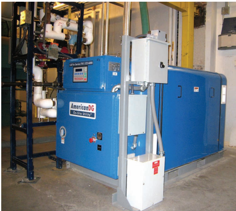
A CHP system supplies electricity, heat and hot water.

The key components of a CHP system are an internal combustion, reciprocating engine driving an electric generator. The clean, natural gas-fired engine spins a generator to produce electricity. The natural byproduct of the working engine is heat. The heat is captured and applied in hotel property applications to supply space heating, heating domestic hot water, laundry hot water or to provide heat for swimming pools and spas. The CHP process is very similar to an automobile, where the engine provides the power to rotate the wheels, and the byproduct heat is used to keep the passengers warm in the cabin during the winter months.