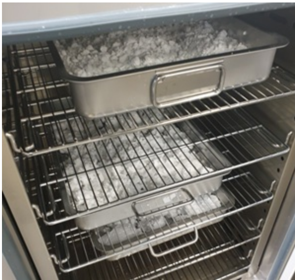
Trays of high purity lithium carbonate produced at the SiFT Pilot Plant in Richmond, BC, Canada, being dried in a controlled temperature oven prior to analysis.